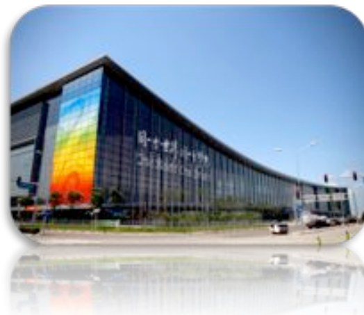
China International Conference Centre (CNCC)

This will be the first ICE meeting to take place in Mainland China and we would like to congratulate the Chinese Endocrine Society on their winning bid. We are already looking forward to a colourful and creative congress in Asia!